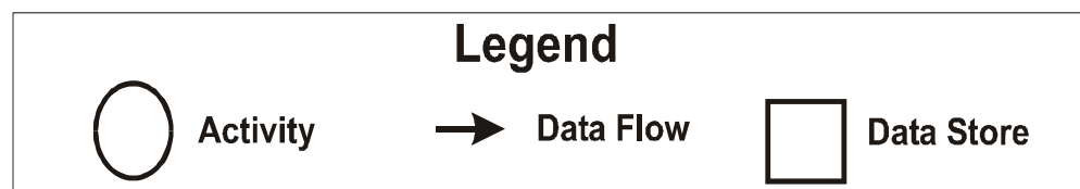
Figure 1: Software Measurement Process Model.